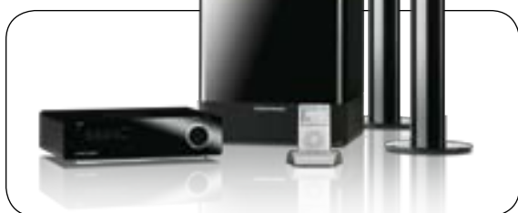
iPod not included