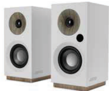
S-801PM POWERED SPEAKERS