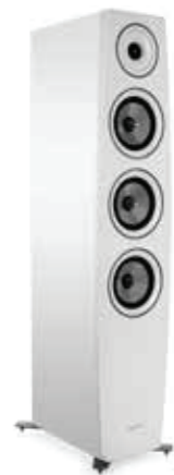
C 97 II TOWER LOUDSPEAKER

High quality cabinetry, designer finishes and advanced technologies combine to create gorgeous furniture with exceptional acoustics surpassed only by their beauty. New heather tweed grilles, magnetic attachment for the grilles, satin painted MDF baffles, cast metal feet with brushed finish and a smaller and sleeker logo in chrome metal look make the Concert series aesthetically elegant, while providing exceptional performance.