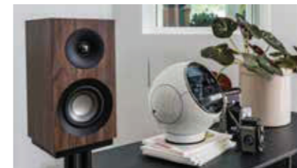
STUDIO 8 SERIES