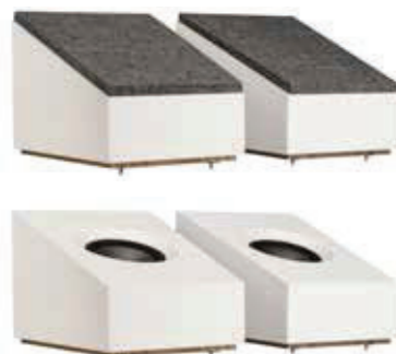
S 8 ATM DOLBY® ATMOS® ELEVATION SPEAKER

Part Number: 1064332 (Black) 1064378 (White) 1064586 (Walnut)