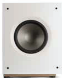
S 810 SUB SUBWOOFER

The Jamo Subwoofer line-up is comprised of more than just highly versatile, quality products; each member of the range is tuned with a dynamic, balanced sound that can be combined with an existing Jamo sound system or any other quality audio system. Jamo subwoofers are specially designed to broaden your experience of low frequencies, from explosions and earthquakes to subtle musical nuances and dynamic peaks.