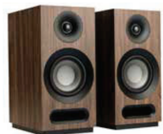
S 803 MONITOR SPEAKERS