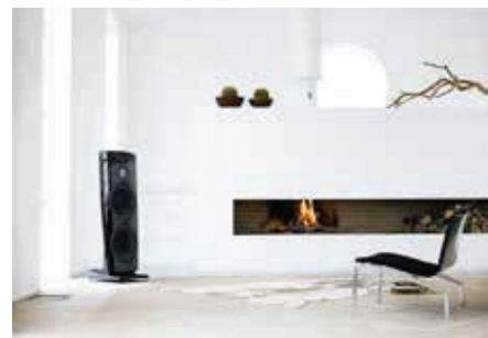
THE LEGENDARY JAMO R 909