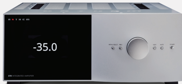
Available in both black or silver (as shown).