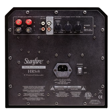
Rear panel configuration for HRS12; HRS10; HRS8