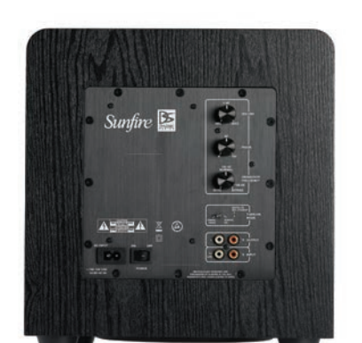
Rear panel configuration for the SDS12, SDS10 and SDS8