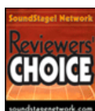
Borea BR03 SoundStageNetwork- May 2020