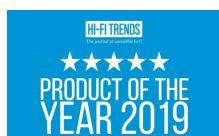
Borea BR03 Hi-Fi Trends - January 2020