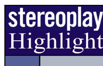
Borea BR03 Stereoplay - November 2019