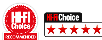
Borea BR03 Hi-Fi Choice - February & August 2020