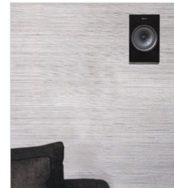
R8a on wall