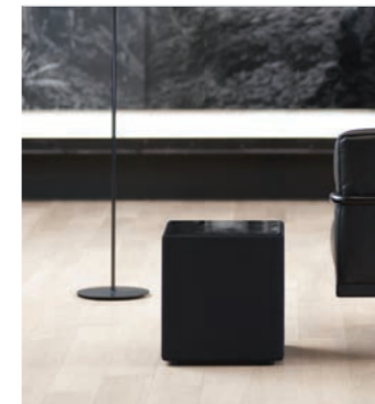
KEF makes a range of matching subwoofers to augment R Series with powerful and controlled bass.