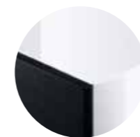
White lacquer "high gloss" Black fabric grill