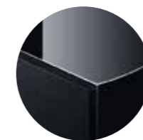
Black lacquer "high gloss" Black fabric grill