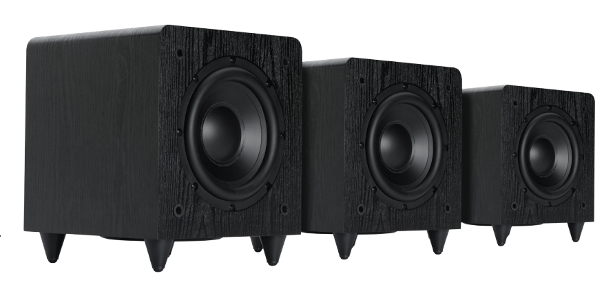
DS-12, DS-10 and DS-8

Features and specifications subject to change.