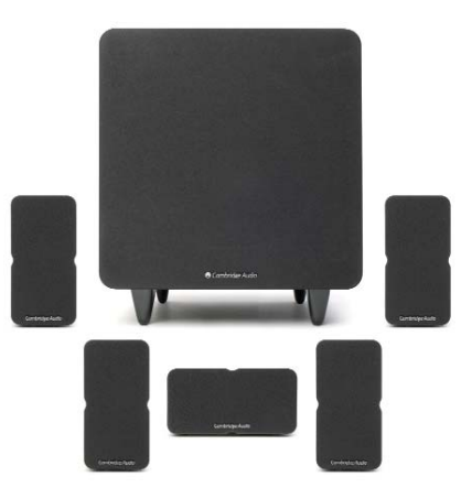
Connect to any AV receiver*