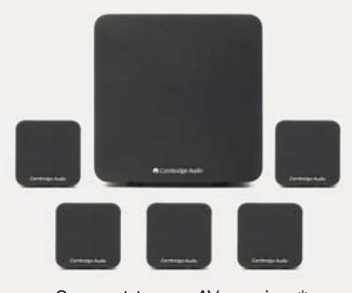
Connect to any AV receiver*