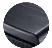
Black ash veneer Black metal grill