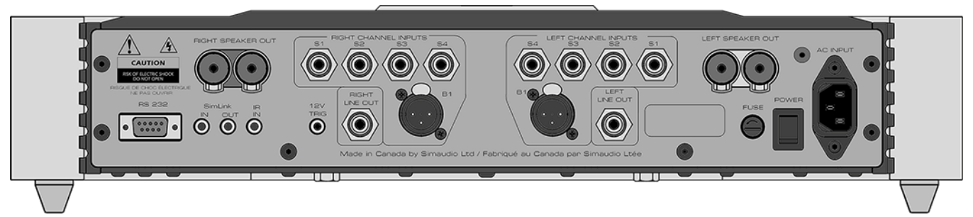
Figure 2: Rear panel of MOON 600i v2 Integrated Amplifier

The rear panel of the MOON 600i v2 dual-mono integrated amplifier will look similar to Figure 2 (above). There are two rows of connectors; the upper row contains one pair of heavy duty gold-plated speaker binding posts for each channel to connect to your loudspeakers. In between these binding posts are four (4) pairs of single-ended RCA inputs labeled S1, S2, S3, and S4. This layout is the result of 600i v2 's dual-mono design, the left channel inputs/outputs are grouped together on one side and the right channel inputs/outputs are grouped together on the opposite side.