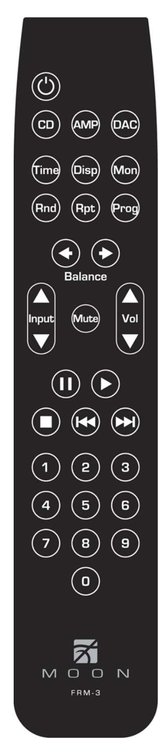
Figure 3: FRM-3 Remote Control

The MOON 600i v2 Dual-Mono Integrated Amplifier uses the 'FRM-3' full function, all aluminum backlit remote control (figure 3). It operates on the Philips RC-5 communication protocol and is can be used with other MOON components such as CD Players, DAC's, Integrated Amplifiers, as well as other Preamplifiers.