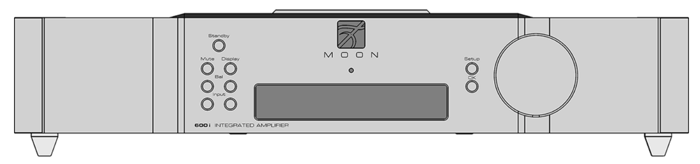
Figure 1: Front panel of MOON 600i v2 dual-mono Integrated Amplifier

The front panel will look similar to Figure 1 (above). The large display window normally indicates the current volume level and, whenever you change the input, it will briefly show the selected input label.