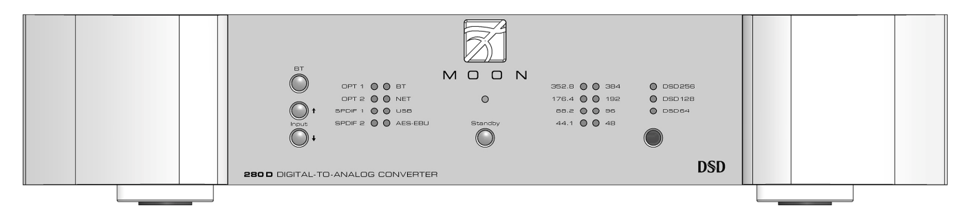
Figure 1: Neo 280D Front panel

The front panel will look similar to Figure 1 (above). The "Standby" button disengages all internal circuitry from the power supply. When switching back from "Standby" to the "on" mode, the selected 'input' will be memorized from the previous listening session. The blue indicator LED turns off when the 280D is in "Standby" mode.