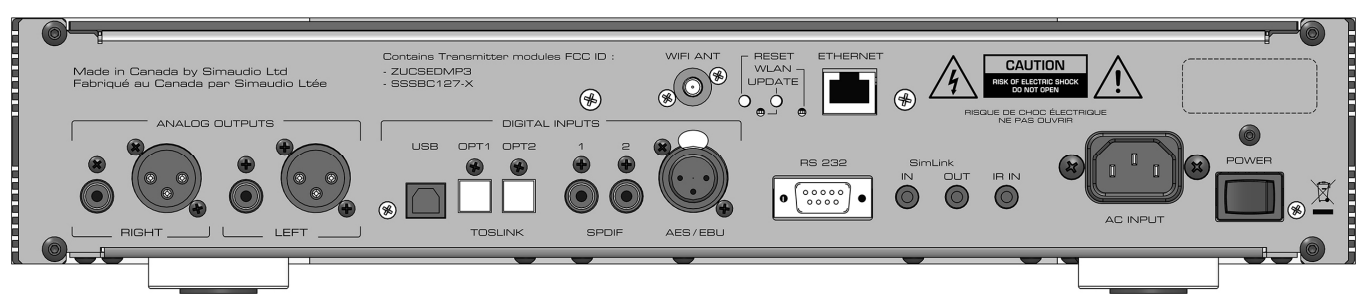
Figure 2: Neo 280D Rear panel

The rear panel will look similar to Figure 2 (above). On the left side are two pairs of analog outputs; Labeled "Right" and "Left", each with a single-ended RCA and balanced XLR connector. These are "Fixed Level" outputs, intended to be connected to a line-level input on either your preamplifier or integrated amplifier. We strongly recommend that you use the balanced XLR connectors to maximize performance. Don't hesitate to use high quality interconnect cables*. Poor quality interconnect cables can degrade the overall sonic performance of your system.