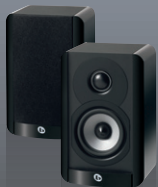
A 23 2-way 3 1/2" Bookshelf Speaker • Frequency Range 80Hz - 25kHz • Recommended Amplifier 10 - 150 Watts