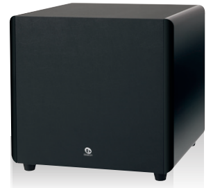
ASW 250 250-Watt Peak 10" Down-Firing Powered Subwoofer • 100 watts RMS (250 watts peak) • Frequency Range 35Hz - 150Hz