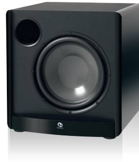
ASW 650 650-Watt Peak 10" Front-Firing Powered Subwoofer • 300 watts RMS (650 watts peak) • Frequency Range 28Hz - 150Hz