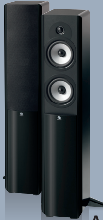
A 250 2-way Dual 5 1/4" Floorstanding Speaker • Frequency Range 45Hz - 25kHz • Recommended Amplifier 10 - 175 Watts