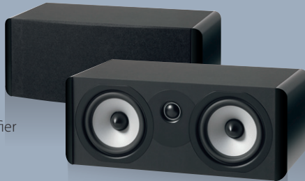
A 225C 2-way Dual 5 1/4" Center Channel • Frequency Range 65Hz - 25kHz • Recommended Amplifier 10 - 175 Watts