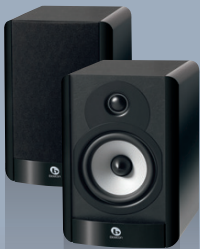
A 26 2-way 6 1/2" Bookshelf Speaker • Frequency Range 51Hz - 25kHz • Recommended Amplifier 10 - 150 Watts