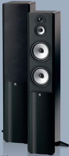
A 360 3-way Dual 6 1/2" Floorstanding Speaker • Frequency Range 38Hz - 25kHz • Recommended Amplifier 15 - 200 Watts