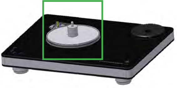
Pic. 7.1: Placing the belt