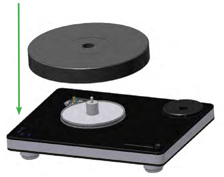
Pic. 8: Setting the platter onto the bearing

Now you can set the platter carefully onto the bearing. To avoid damage, make sure you slide the platter slowly and cautiously on the sub-platter/ bearing assembly. Hold the platter securely, so the platter does not slip or fall on your turntable.