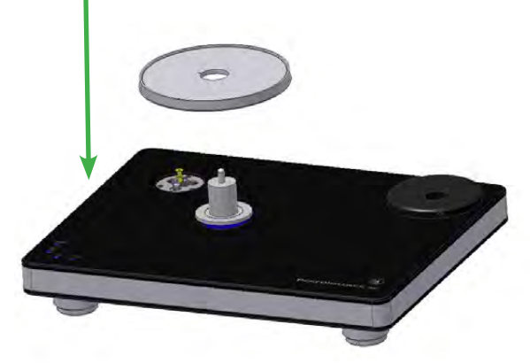
Pic. 7: Setting the sub-platter

After that, take the included belt and place it around the motor and the sub-platter (see Pic. 7.1). At this point the sub-platter will be higher than the pulley. This is normal, as the CMB requires the weight of the platter to fully engage it.