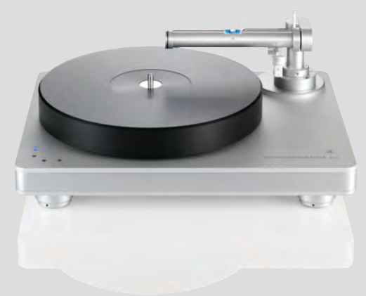
Silver with silver chassis