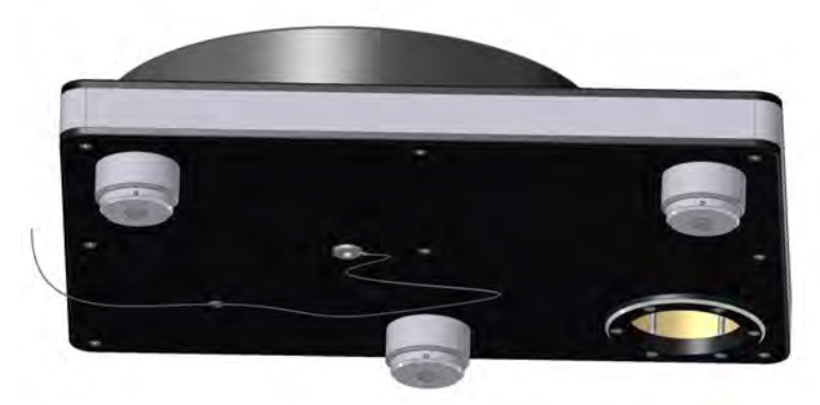
Pic. 4: Grounding the bearing of the Performance DC

To avoid hum noises it can be necessary to ground the bearing. For that please plug in the provided ground cable into the hole of the screw from the bearing at the bottom side of the turntable.