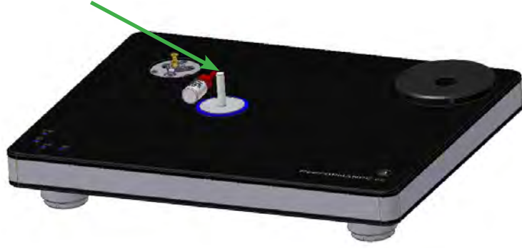
Pic. 5: Bearing oil

Please remove the protective seal from the bearing shaft and place two drops of the synthetic bearing oil on the ceramic bearing shaft. Slip the bearing top onto the bearing shaft of the turntable (also available through <u>www.analogshop.de</u> Art. No. AC068).