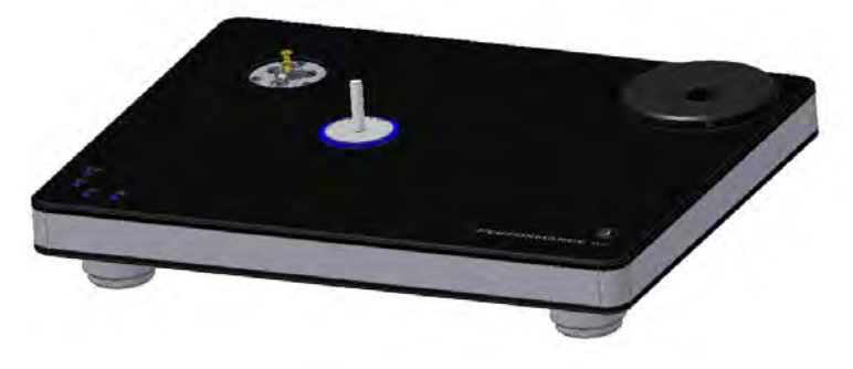
Pic. 3: Performance DC chassis

Place the pre-mounted chassis on your hifi-rack or another suitable surface.