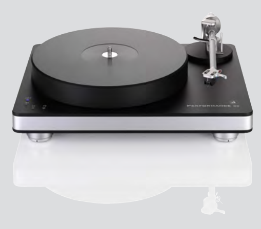
Black with silver chassis