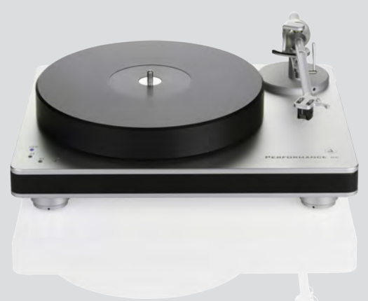
Silver with black chassis