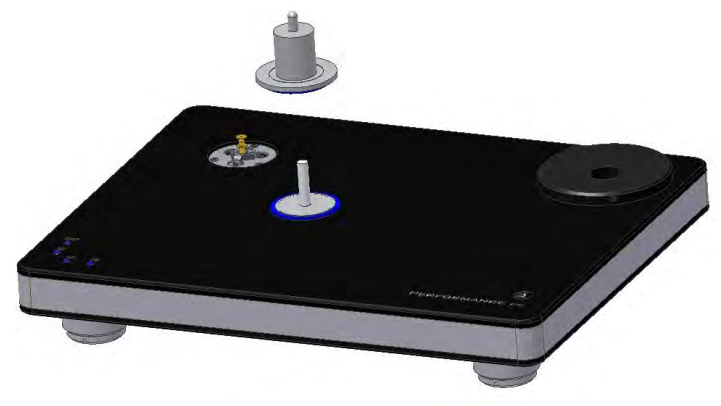
Pic. 6: Fitting the bearing upper part

Now you can set the bearing upper part carefully onto the bearing. To avoid damages make sure you slide the bearing upper part slowly and carefully on the polished ceramic shaft.