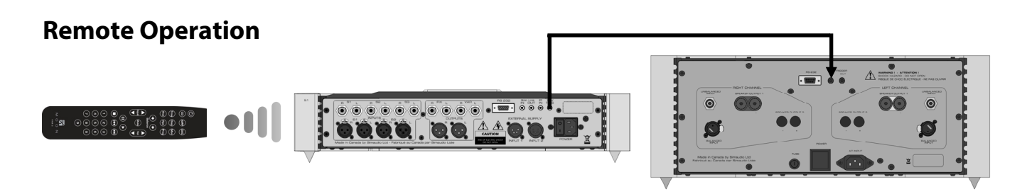
Figure 4: Remote Operation with 12V Trigger

In figure 4 we have a 740P Preamplifier and 860A amplifier connected together via their respective 12V triggers; The 12V trigger output on the 740P is connected to the 12V trigger input on the 860A (using a 1/8" mini-jack cable). When you turn on the 740P via remote control (or its Standby button), the 860A will turn on automatically. The same rule applies when you put the 740P into Standby mode.