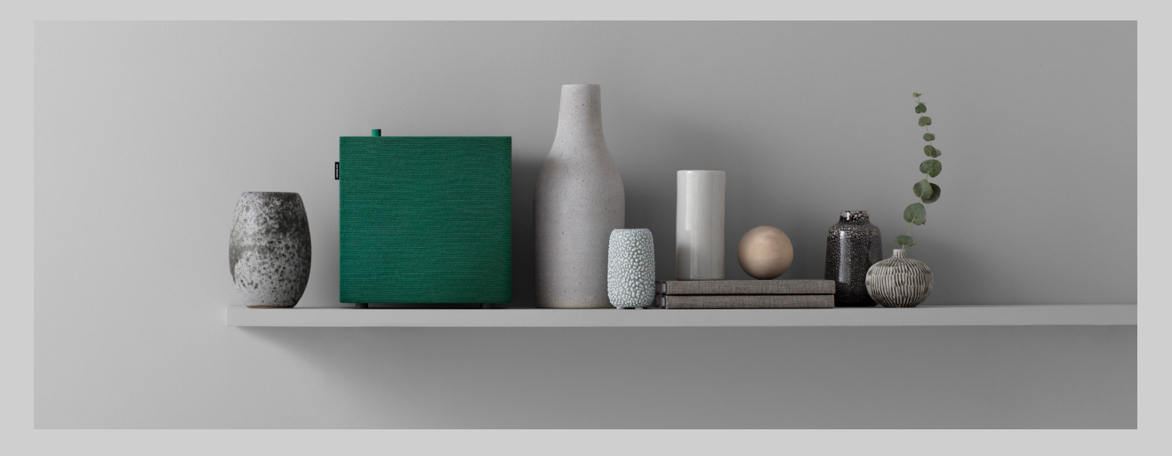
AirPlay and AirPlay logo are trademarks of Apple Inc. registered in the U.S. and other countries. The Wi-Fi CertifiedTM logo is a certification mark of Wi-Fi Alliance®. Chromecast is a trademark of Google Inc. Spotify and Spotify logos are trademarks of the Spotify Group, registered in the U.S. and other countries. The Bluetooth® word mark and logos are registered trademarks owned by the Bluetooth SIG, Inc.

Connected Speakers currently come in six color variations, including Dirty Pink, Vinyl Black, Plant Green, Concrete Grey, Goldfish Orange and Indigo Blue.